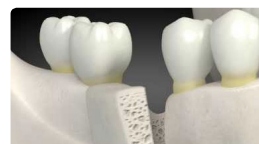
Following use of “calcium materials” and a barrier membrane, lost bone has been regenerated