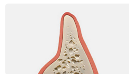
Normal bone contours and quantity have been compromised.

This method of bone regeneration is highly predictable, and often results in complete regeneration of jaw bone in the area being treated.