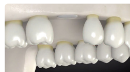
Large gap where a significant bone loss in the upper anterior area.