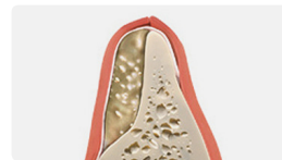
A membrane barrier is placed over “calcium materials” in the desired area of the bone regeneration.